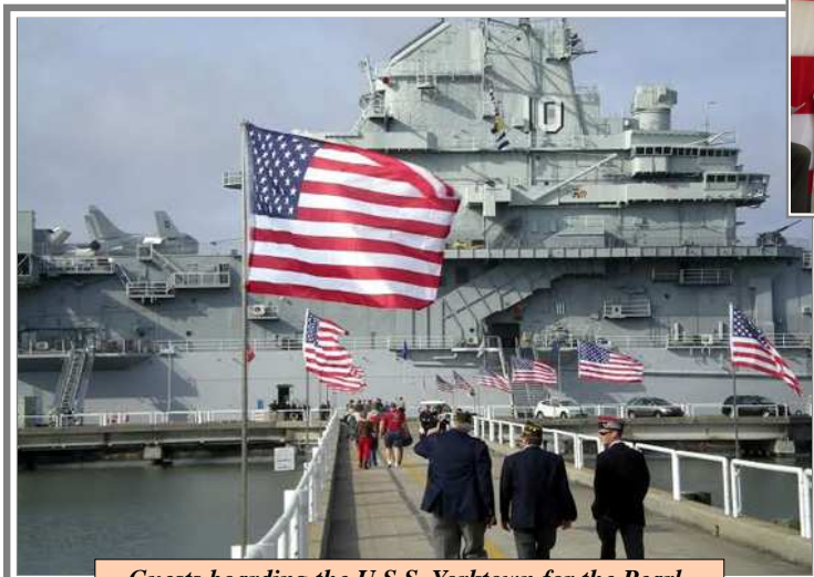
Guests boarding the U.S.S. Yorktown for the Pearl Harbor Remembrance Day Memorial Service